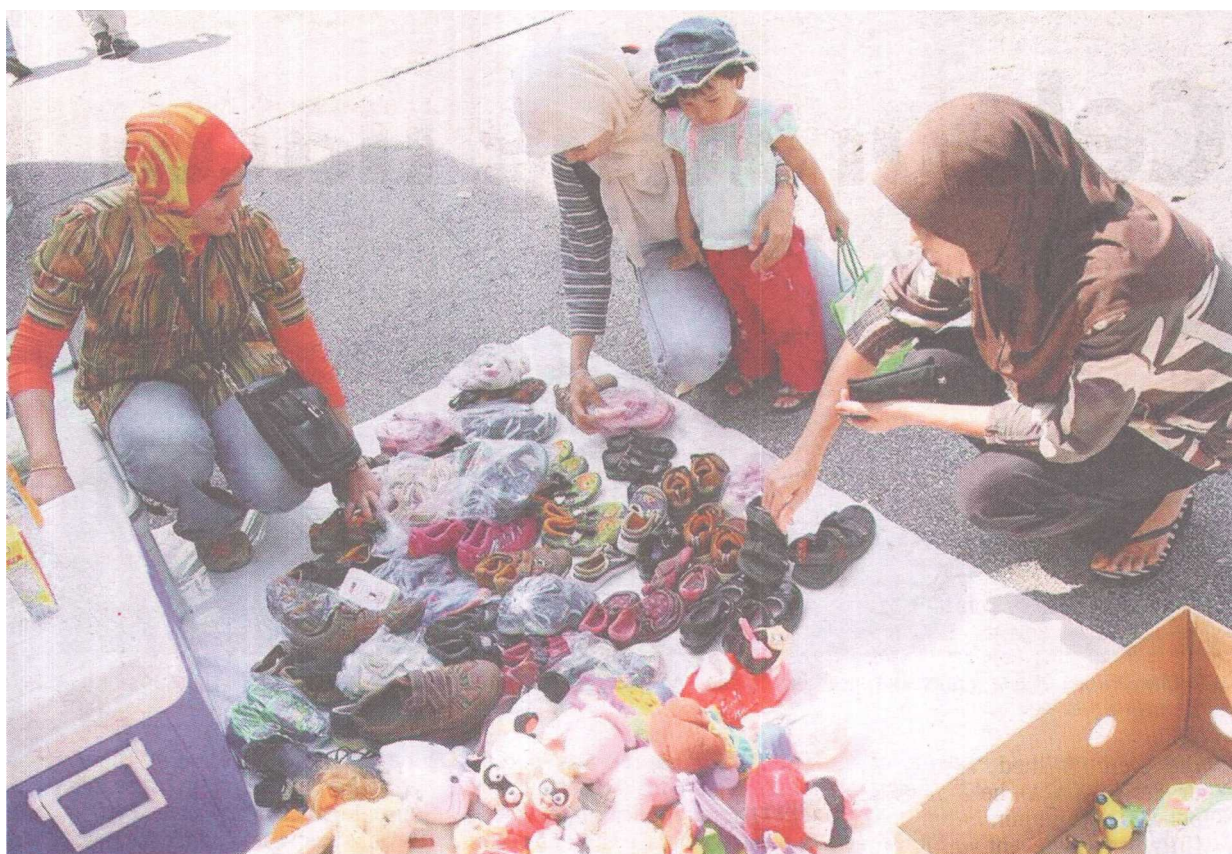
Looking for bargains: The car boot sale was a hit among visitors.

Language English Page No 1to3 Article Size 1167 cm 2 Color Full Color ADValue 43,672 PRValue 131,015