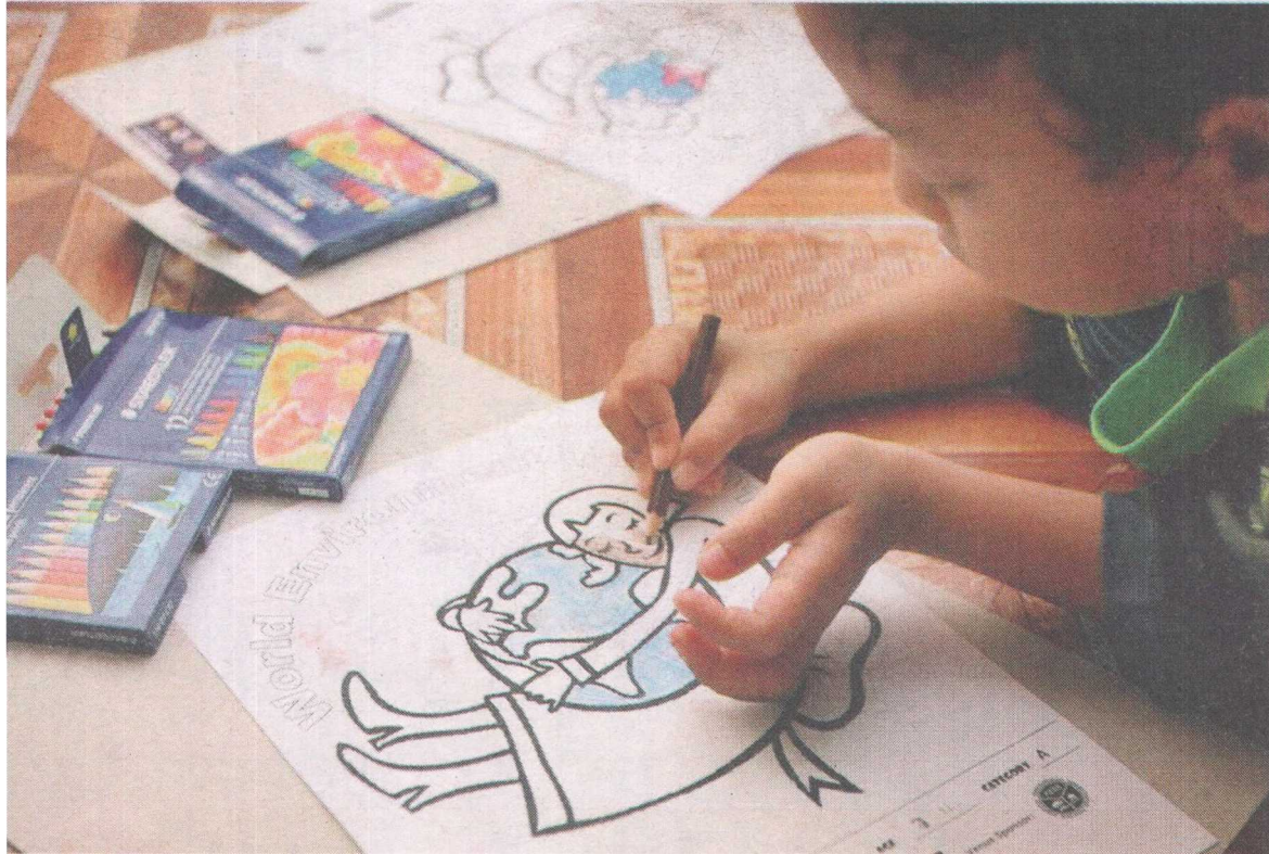
In focus: A participant during the Era Art Club colouring contest.

Language English Page No 1to3 Article Size 1167 cm 2 Color Full Color ADValue 43,672 PRValue 131,015