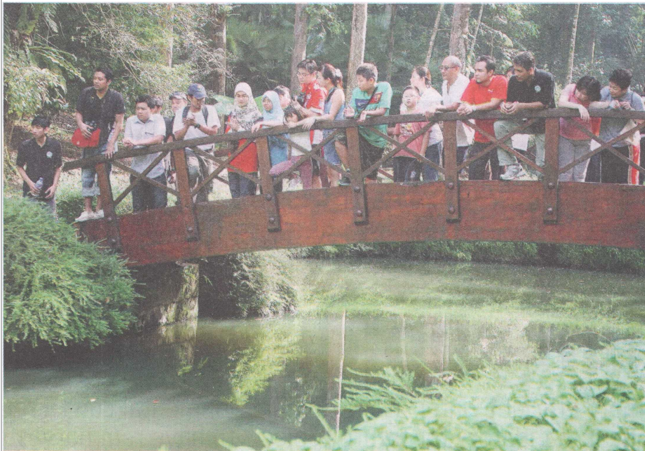
Observing keenly: Participants of the guided nature walk looking at fishes at the lake in FRIM.